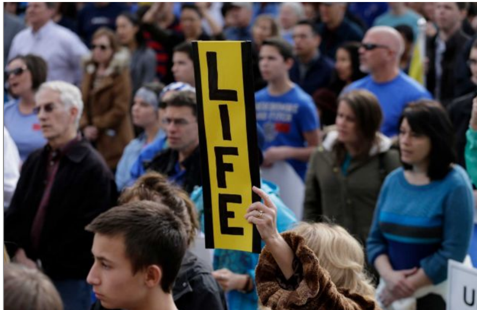
Anti-abortion supporters gather around the Texas Capitol during a Texas Rally for Life, Saturday, Jan. 24, 2015, in Austin, Texas.